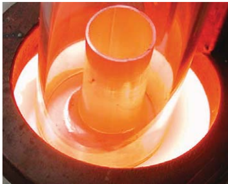
Induction Brazing of Stainless Steel in Protective Atmosphere (Brazing Temperature)