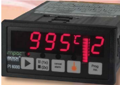
Programmable PID Controller PI 6000