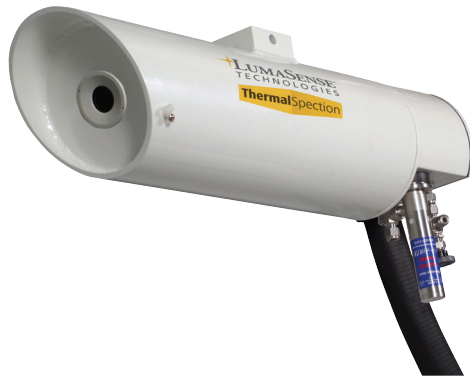
Figure 2: ThermalSpection CVM system

Accurately measuring temperature has always been one of the most important and difficult things to do when monitoring the safety of critical vessels in refining and other industrial plants. Extreme temperatures and non-uniform temperature gradients make it nearly impossible for traditional temperature-measurement methods to monitor every critical point or to obtain complete temperature data.