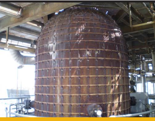
Figure 1: Critical Vessel View

Real time fault detection and monitoring for critical vessels